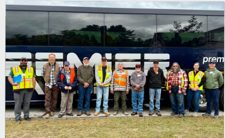
North Country Bus Tour Crew - October 2025