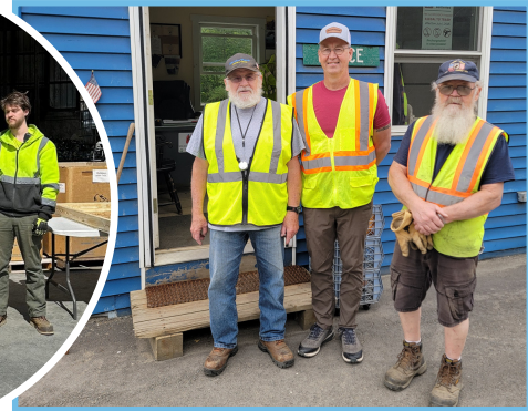
On-Site Technical Assistance supports operators in real time