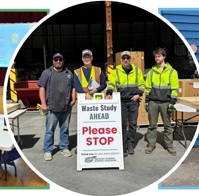
Train-the-Trainers empowers solid waste operators