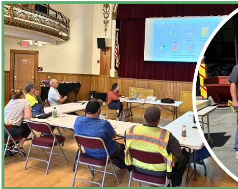
Full Cost Accounting Models show recycling's economic value